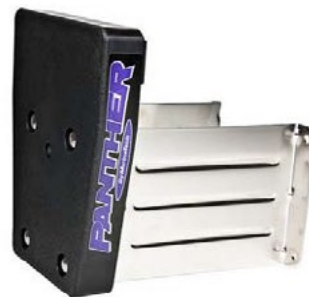
Bracket setback length including Poly board is 10.125"