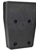
Poly board measures approx. 8" wide x 10" long Part number 99-55650

Always remove your motor from bracket when trailering. Failure to do so may result in damage to Boat, Motor or Bracket.