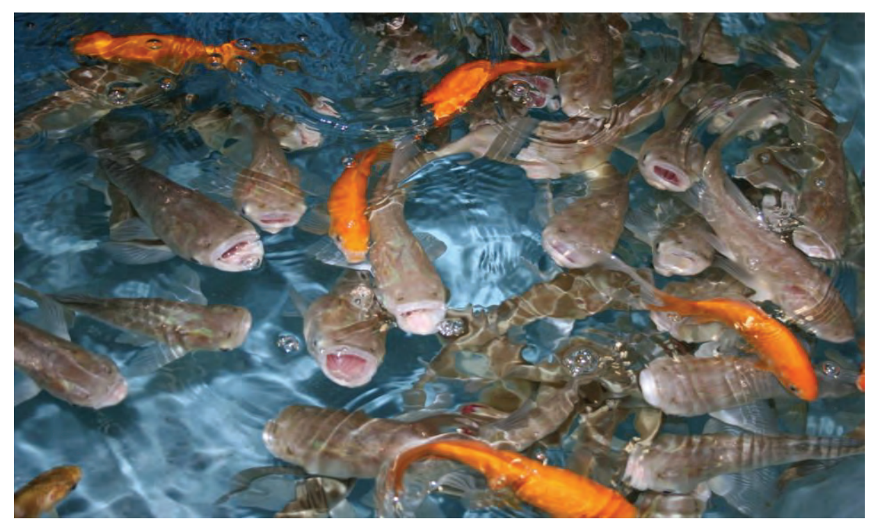
Figure 3. Bighead carp surfacing for food pellets. Goldfish provide feeding cues to carp, which are accustomed to feeding on plankton.

Figure 2. Holding tanks used to maintain bighead carp and silver carp in the laboratory. Water is pumped by submerged pumps into overhead filters supported on fiberglass grids. Water passes through ammonia-removing resin chips, carbon, and foam pads and then showers back into the tank. Net skirts attached to grids prevent silver carp from jumping out of the tanks.