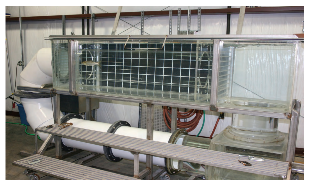
Figure 5. Brett swim tunnel with bighead carp undergoing swimming trial. Front and rear grids at either end of the tunnel are exchangeable with others of different pore size. They can contain fish of various sizes and also act as collimators, providing rectilinear flow.