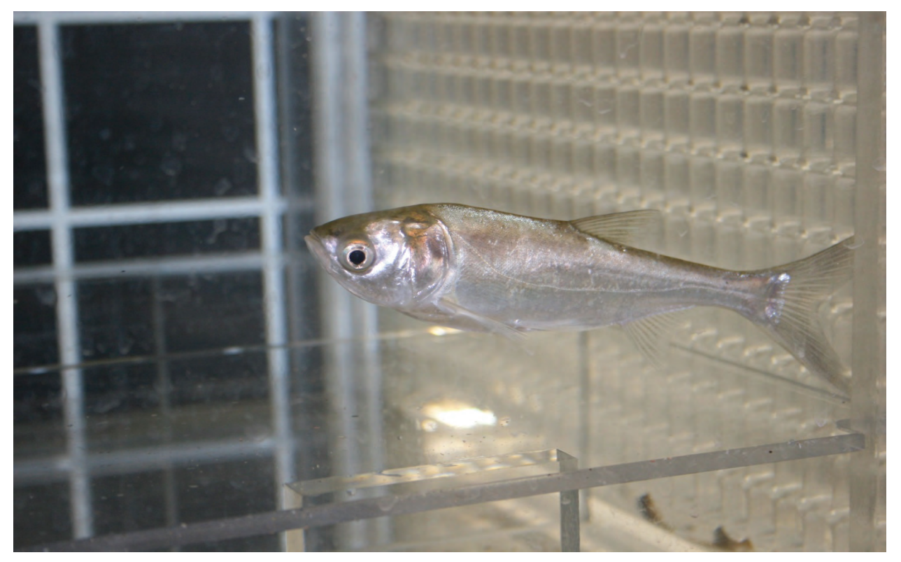
Figure 7. Sub-adult silver carp tail-bracing in Brett swim tunnel.

Carp swimming performance metrics are useful tools for managers and planners. They enable estimates of passage time across given combinations of distances and water velocities. As a result, representative swim speeds have been used to estimate duration of exposure to electrical fields and to develop operational guidelines for the electrical barrier in the Chicago Ship and Sanitary Canal (Holliman 2010). Swim speeds can also be used to evaluate dispersal along various pathways (e.g., time required to travel a given distance) and to evaluate the likelihood of establishment based on bioenergetics models (e.g., suitability of available plankton resources to support carp growth). A recent model suggested that the threat of carp establishment and food web disruption was small in oligotrophic portions of the Great Lakes but that some productive regions, such as Green Bay in Lake Michigan and the West Basin in Lake Erie, provided sufficient plankton for the energetic needs of the fish (Cooke and Hill 2010). This model, however, assumed swim speeds of < 5 cm/s. Because energy requirements increased logarithmically within the range evaluated (0-4 cm/s), use of higher documented sustained swim speeds (20-80 cm/s) could have indicated lower likelihoods of sustainability.