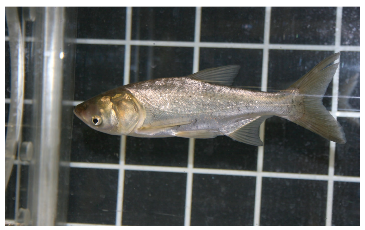
Figure 6. Sub-adult bighead carp free-swimming in Brett swim tunnel.

<sup>1</sup> Rheotaxis is the percentage of all fish tested that oriented headfirst into flow at test water velocities. Sustained swimming speed is the maximum observed water velocity at which any individual fish tested was able to swim more than 200 minutes. Prolonged and burst swim speeds correspond to 1-min and 0.1-min endurance times, respectively, as predicted by regression models.