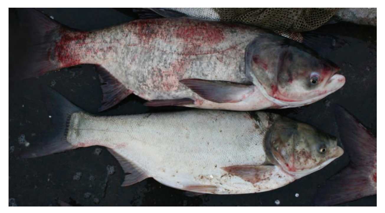
Figure 1. Adult bighead carp (upper) and silver carp (lower) collected from Forest Home Chute, a backwater of the lower Mississippi River. Note differences in size of head and pectoral fin.

into aerated tanks on trucks, and driven directly to the laboratory. On arrival, water temperature of the transport tank is equilibrated with that of the holding tanks (transferring holding tank water to transport tank for larger fish, and floating containers of the transport water in holding tanks for smaller fish).