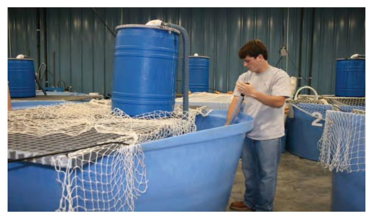
Figure 2. Holding tanks used to maintain bighead carp and silver carp in the laboratory. Water is pumped by submerged pumps into overhead filters supported on fiberglass grids. Water passes through ammonia-removing resin chips, carbon, and foam pads and then showers back into the tank. Net skirts attached to grids prevent silver carp from jumping out of the tanks.